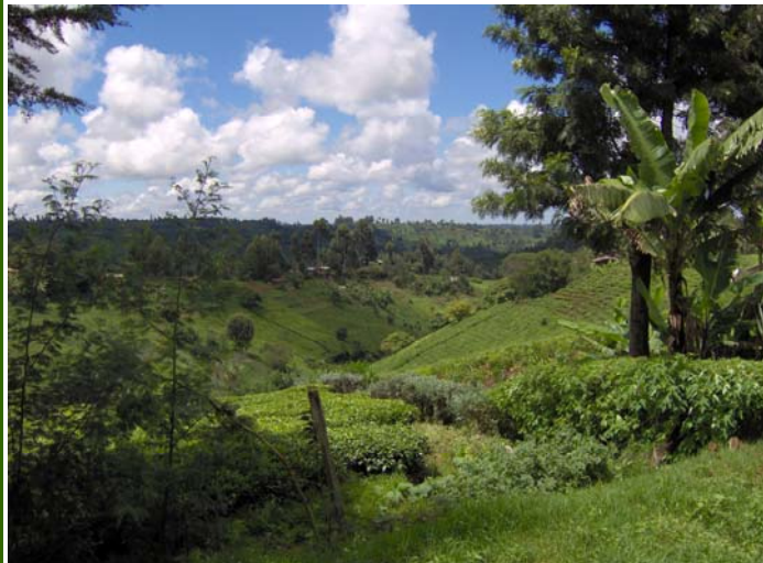
Above: Beautiful countryside in the green tea hills of Mataara.

I am very happy in my current mission assignment. Mataara is a rural parish, straddling the foothills of the Aberdare mountains sixty miles outside of Nairobi. There are four churches in the parish. Normally three of these would be termed "outstations," however, I try to treat them all similarly so that no one feels they have a second-rate church to go to. You see, it's very important for