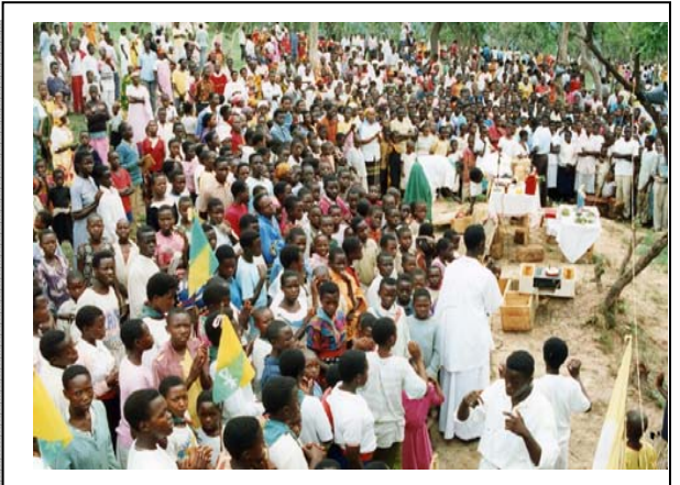
Africa has the fastest growing Church in the world.

It costs, on average, $4,000 per year to train each student. With about 250 students we must find $1 million every year for this work! My job in the SMA International Development Office is to find ways of helping to raise this amount until the new branches of the SMA are self-sufficient.